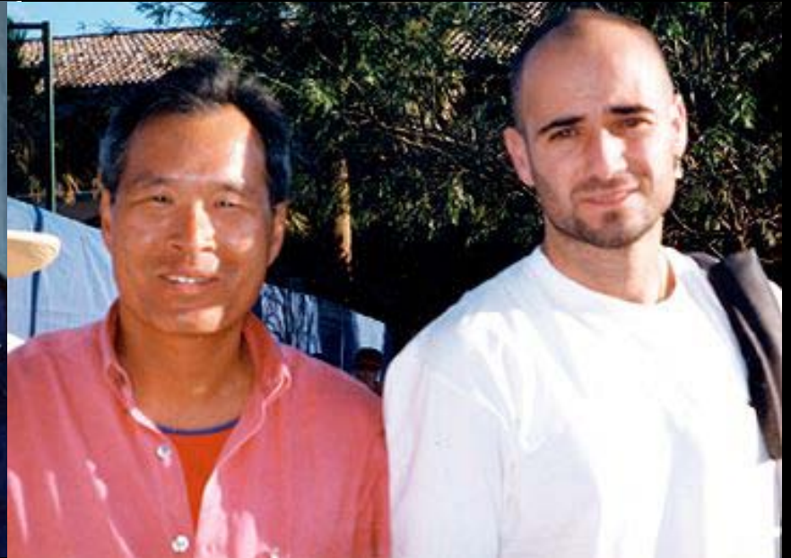
Andre Agassi, one of only 5 male tennis players to have won the career Grand Slam (all 4 major championships)

With the Right Coach, Anything is Possible!