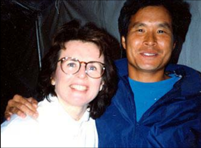
Billie Jean King, first woman pro athlete to earn $100,000/year and founder of Women's Pro Tennis