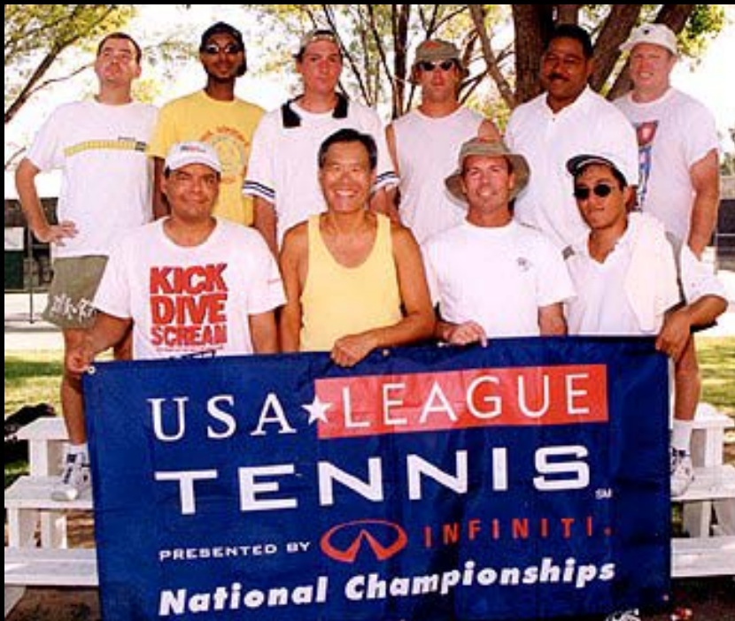
Top 10 in U.S. at 2000 Nationals